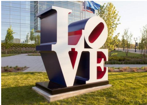
Robert Indiana, Love, 1966-1999. Courtesy of Sculpture Milwaukee.

This summer, the world's largest outdoor art gallery, Sculpture Milwaukee, played a major role in the placemaking effort to bring Wisconsin Avenue to life. For just a few more weeks, visitors can take in the 21 unique sculptures created by artists from around the world, located on downtown's main thoroughfare between Prospect and 6th Streets.