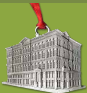
2014 - Iron Block Building