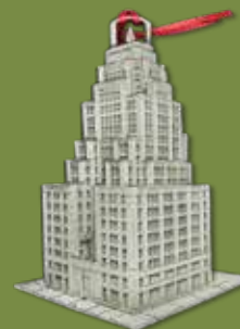
2011 - Milwaukee Gas Light Building