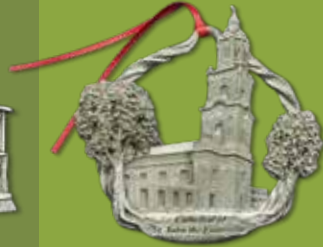
2003 - Cathedral of St. John the Evangelist