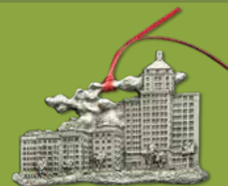
2010 - The Cudahy Tower Apartments & Condominiums