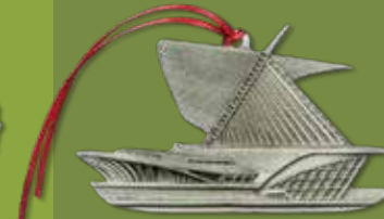
2002 - Milwaukee Art Museum