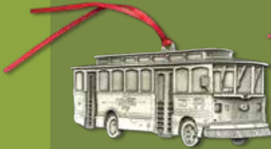
2005 - Downtown Trolley