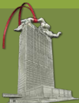
2013 - U.S. Bank Tower