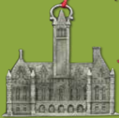
2009 - Milwaukee Federal Building & U.S. Courthouse