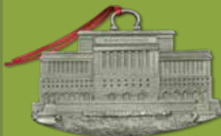
2012 - Milwaukee County Courthouse