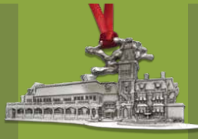
2016 - The Wisconsin Club