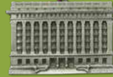
2007 - Northwestern Mutual Corporate Headquarters