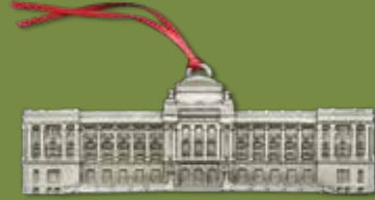
2006 - Central Library