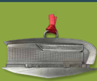
2018 - Fiserv Forum