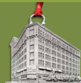
2015 - Posner Building