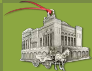
2001 - Pabst Theater