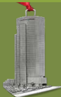
2017 - Northwestern Mutual Tower and Commons