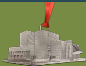
2019 - Marcus Performing Arts Center