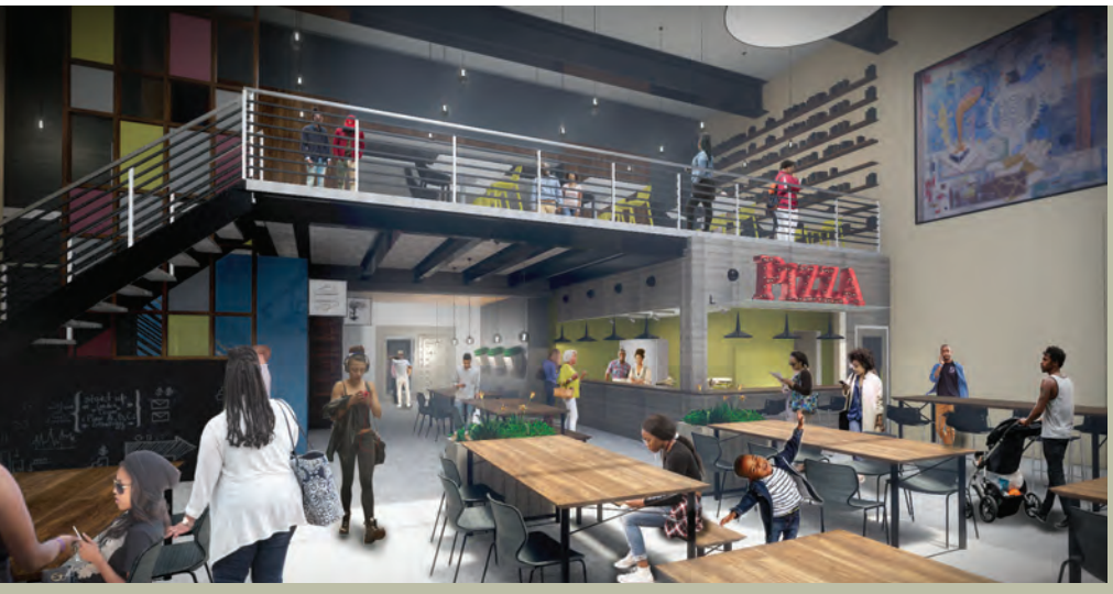
Architectural rendering of the new Sherman Phoenix market hall